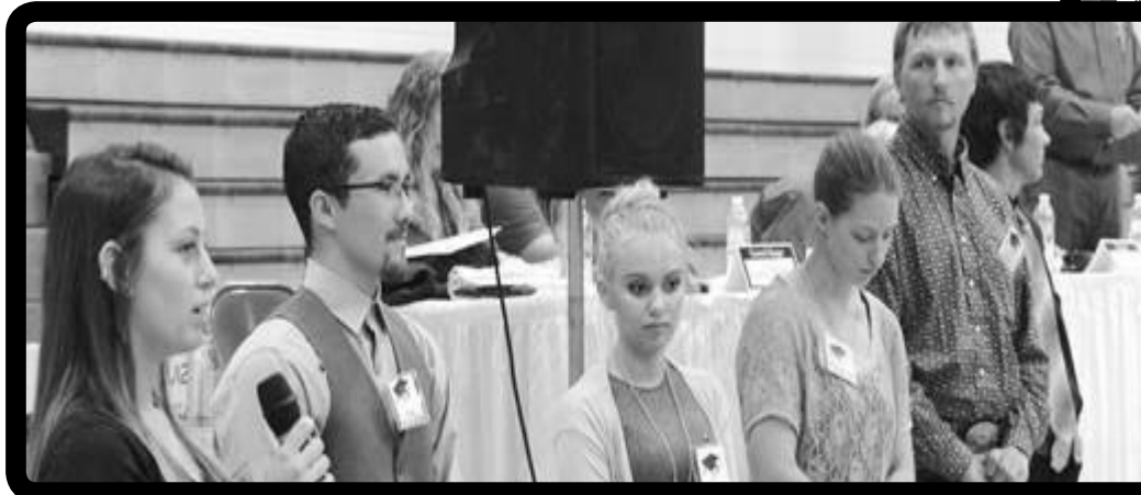
Pictured on the left Carbon's 2018 Scholarship recipients!!