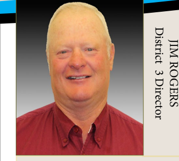
Board Actions SEPTEMBER 2019

Approved the Department Production and Financial Reports.