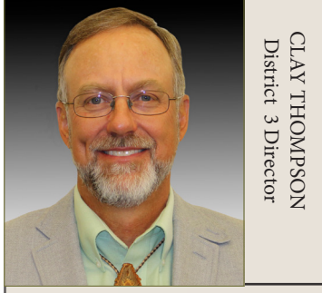
Board Actions SEPTEMBER 2023

Approved the Department Production and Financial Reports.