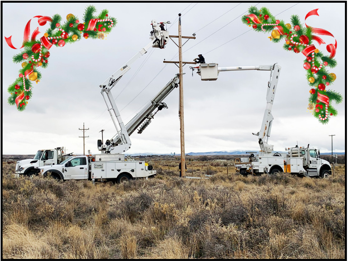
Double Circuit Pole Change Out North Of Saratoga.