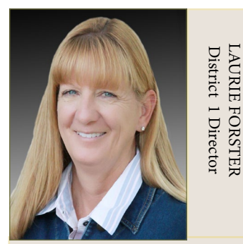
Board Actions JUNE 2021

Approved the Department Production and Financial Reports.