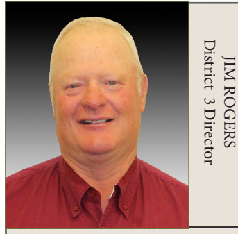
Board Actions JUNE 2023

Approved the Department Production and Financial Reports.